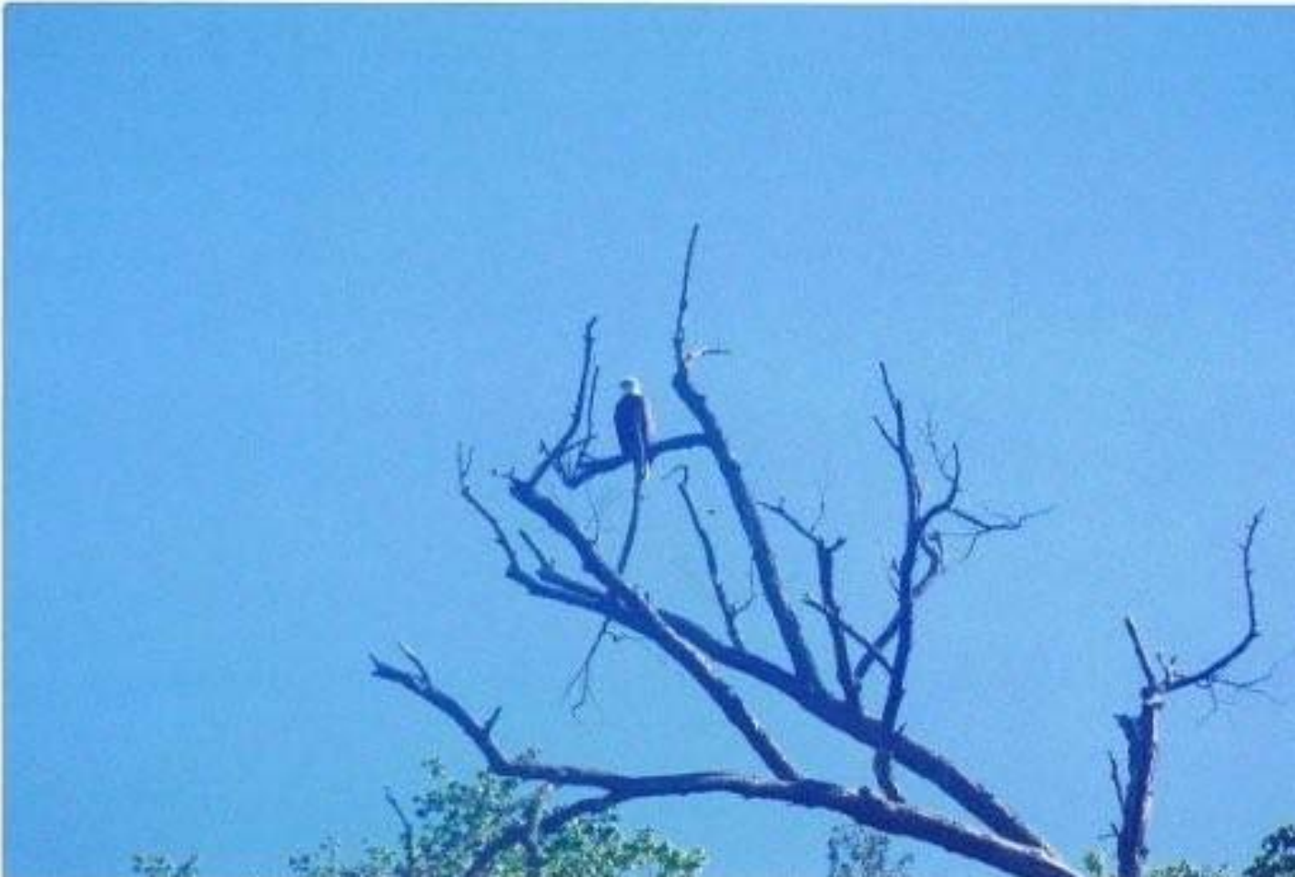
Bald Eagle on Hardy Island.