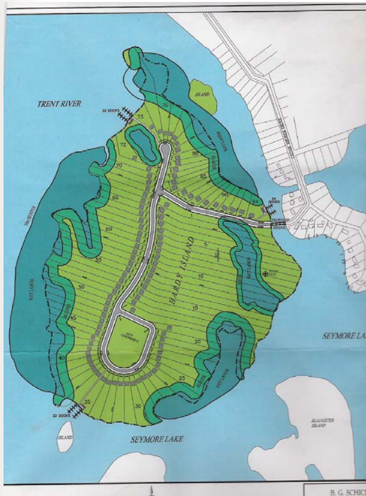
Schickedanz concept plan.